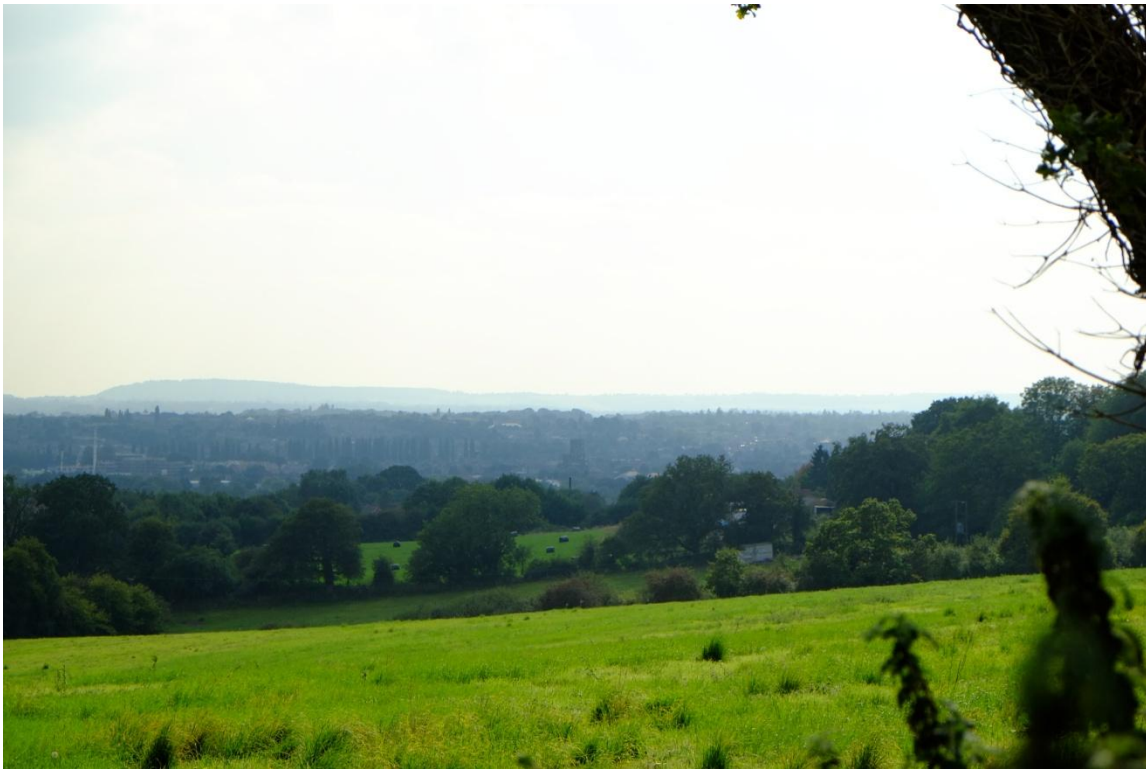
Photo 1 -View south from Stoney Lane towards Coley Farm