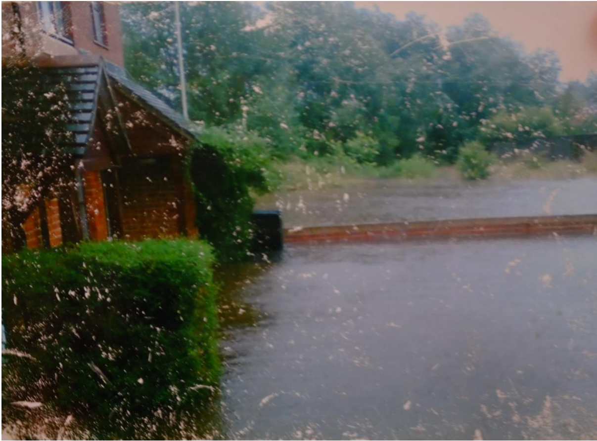
Photo 5 - Fleetwood Close Flooding in 2007. Water nearly 3 feet deep