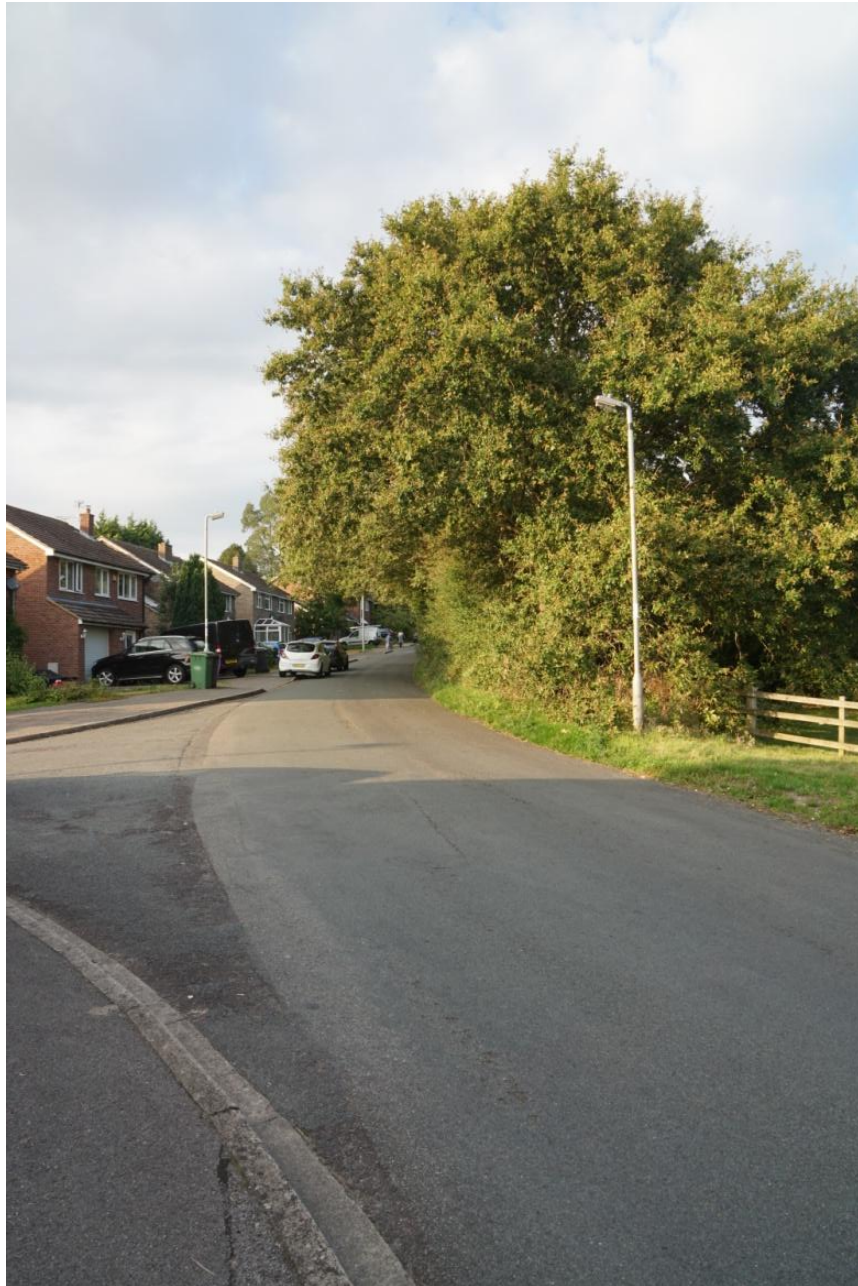
Photo 4 - Stoney Lane looking North from Waller Park - Mature Planting will be Removed for Road Widening