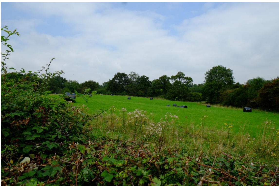
Photo 2 - View of Coley Farm from Manor Park